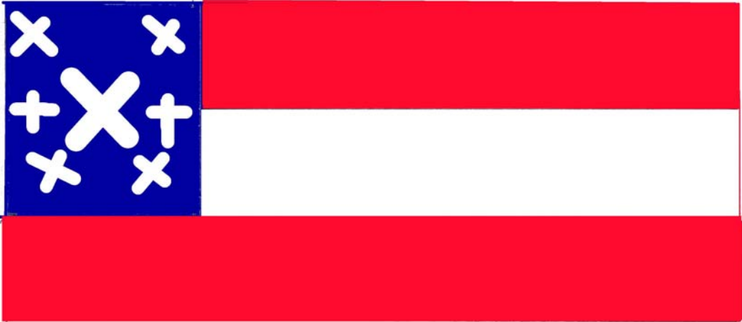
Seven Cross Flag Found On The Battlefield At Fort Davidson