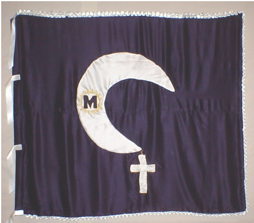
General Marmaduke's Flag

Old State House Museum, Little Rock, Arkansas